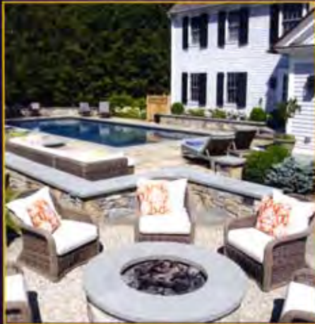
A cozy firepit

Beautiful Outdoor Living Starts Now With Hoffman Landscapes