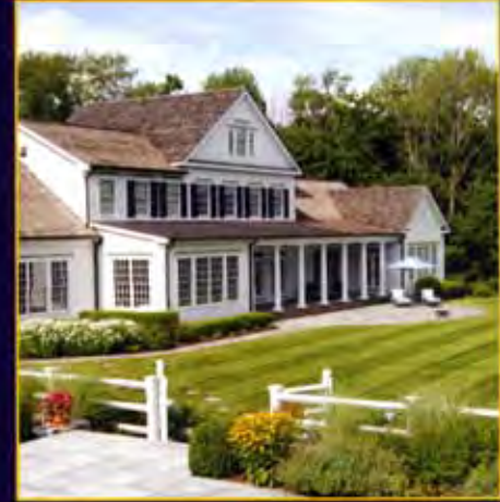
Superior property care

Call us now to get the most out of the warm weather months!