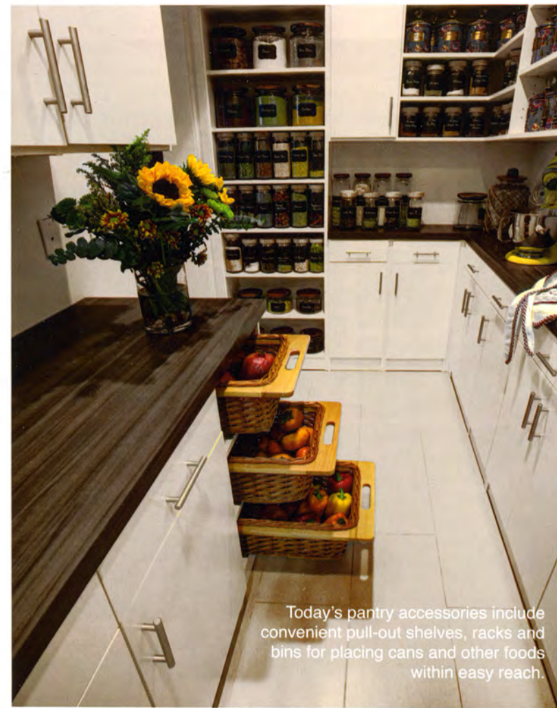
Today's pantry accessories include convenient pull-out shelves, racks and bins for placing cans and other foods within easy reach.