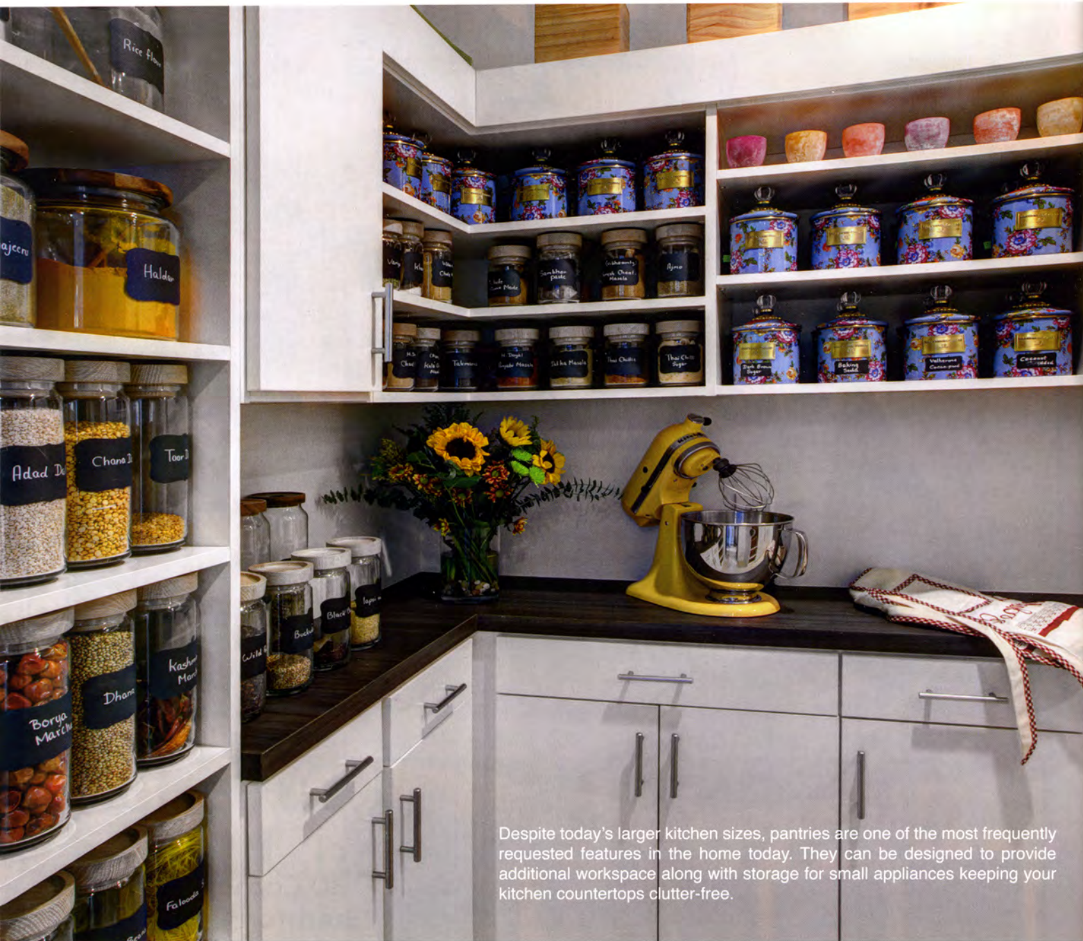
Despite today's larger kitchen sizes, pantries are one of the most frequently requested features in the home today. They can be designed to provide additional workspace along with storage for small appliances keeping your kitchen countertops clutter-free.

make your shopping chore a lot less painful," continues Bradbury. A satisfied Scarsdale, NY customer exclaims, "The new design organized my kitchen pantry in such a way that it gives me easy access to everything. It keeps my kitchen neat, and brings food preparation to a whole new level."